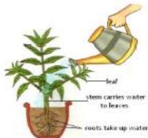
How a plant takes in water